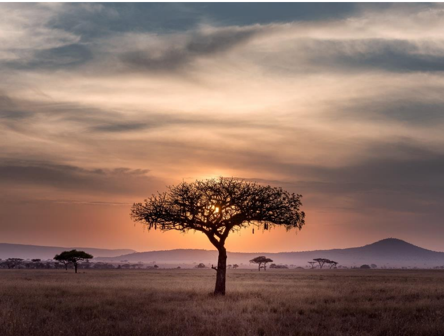
Serengeti, Tanzania